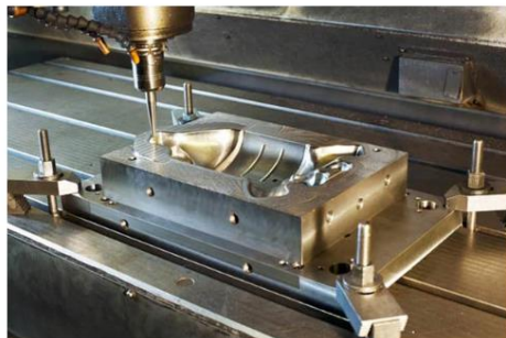
MOLD & DIE