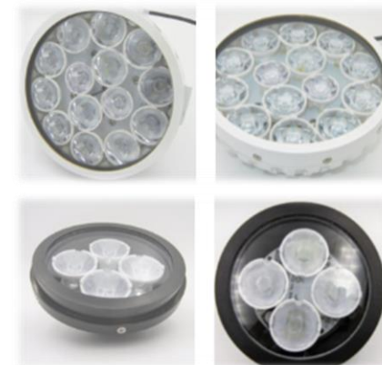
滑行燈 Taxi Lights

subject contrast, improving visibility of runways.