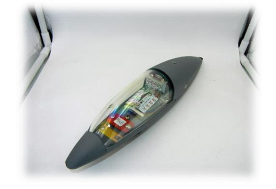
進氣道燈 Inlet Lights

Wingtip light is specifically designed for positioning on the end of the left and right hand wings in order to provide the exact orientation of the aircraft.